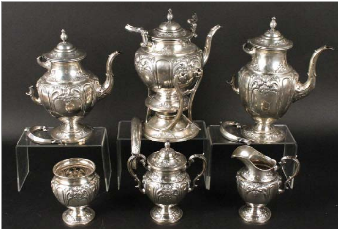
Sterling silver tea/coffee set is just one of many sterling offerings.