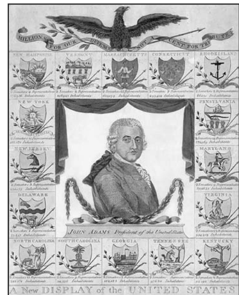
Amos Doolittle — A New Display of the United States, 1799

SEEKING IMPORTANT AMERICAN PRINTS AND MAPS