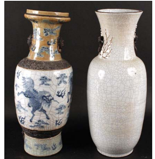
Two of the many Chinese porcelain large vases and fish bowls.

Nye & Company, at 20 Beach Street, offers free auction appraisals every Monday, 10 am to 2 pm. For further information, 973-984-6900 or www.nyeandcompany.com .